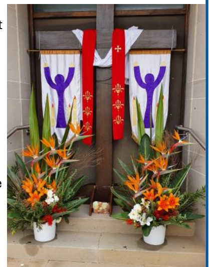
Strelitzias arranged by Falesiu

I think if you see beauty in God's creation, in the very simple and smallest of things, you will eventually come to see the beauty in the bigger things and get an amazing sense of the bigger picture. It is a pleasure to see the delight on anyone's face, when you have crafted something beautiful, where one can appreciate the beauty of God's creation. My dream is to have a flower cart in Haberfield, similar to what they have in Sicily, where