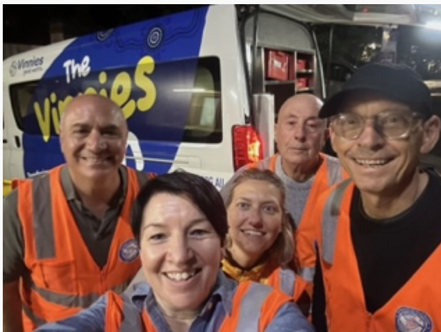
Vinnies Night Patrol Team from St Joan of Arc Parish

Vinnies Night Patrol is a regular sight on Sydney Streets, offering food, friendship and accompaniment to people in need of some extra support. Our parish has a team that volunteers for Night Patrol and prepares sandwiches to take out on the run.