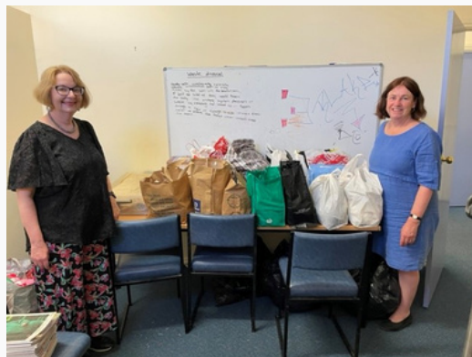
Thank you for all your donations!