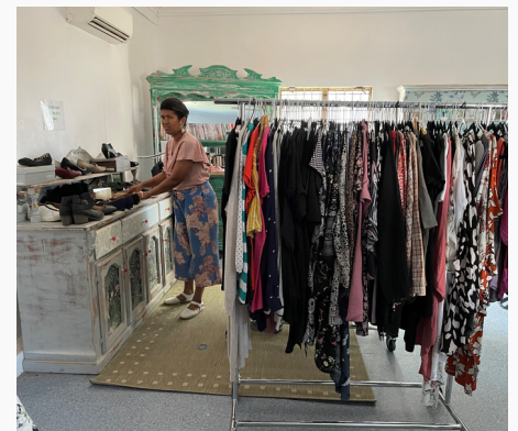
The new CatholicCare Op Shop!