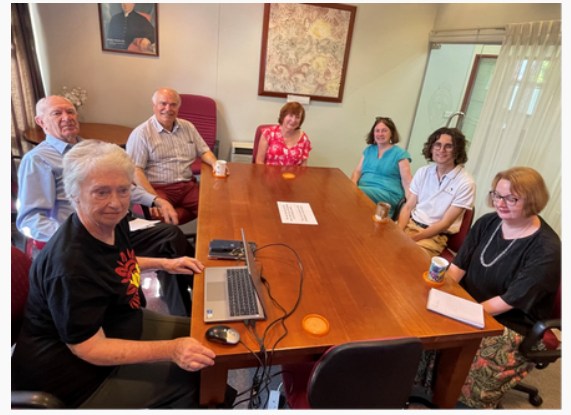
Members of the St Joan of Arc Social Justice Group meeting with the team from the Edmund Rice Centre

Discussion around the referendum and reconciliation with First Nations peoples was the focus at a recent conversation between members of the St Joan of Arc (SJA) Social Justice Group and the team at the Edmund Rice Centre.