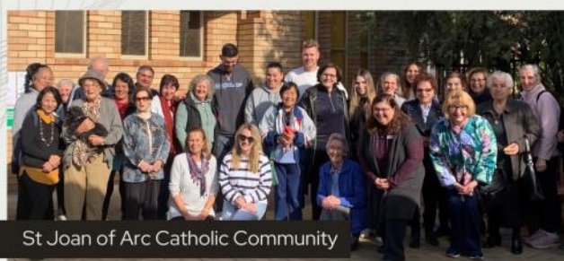
St Joan of Arc Catholic Community

If you're curious, please come along—see one video and take part—then see what you think about continuing. It's totally free and there's no commitment. For more information and location, contact us on 0404 88 22 77 or alpha@stjoanofarc.org.au