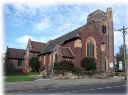
St Oswald's Church, 1928