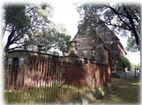
St David's Church, 1869

To Book: Email history@haberfield.asn.au with your name and the number of people attending the walk and EFT the correct amount to BSB 062 178; a/c no. 10007308 with your name. For more information, phone 0412 707 898.