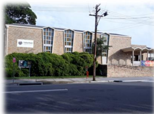
Baptist Church, 1962